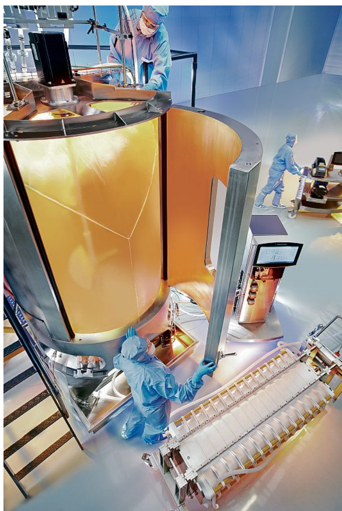
The BIOSTAT® STR of Sartorius offers true scalability in single use and is ideal for high density cell culture applications, monoclonal antibody, recombinant protein and vaccine production as well as seed cultivation for large-scale bioreactors.

The operation of flexible facilities requires great assurance of supply from the manufacturers of single-use technologies. Sartorius uses its material science, Quality by Design, film extrusion, bag making and product design expertise to ensure