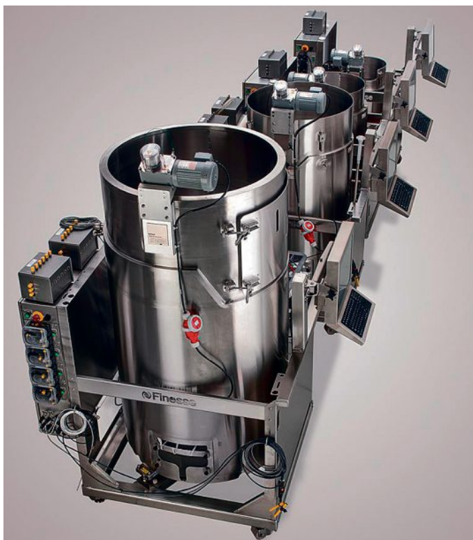
Modular Single Use equipment for flexible GMP production automation at Finesse Solutions Inc.